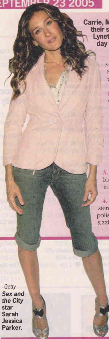
Sex and the City star Sarah Jessica Parker.