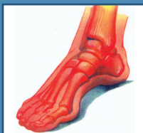
HIGH ARCH FOOT